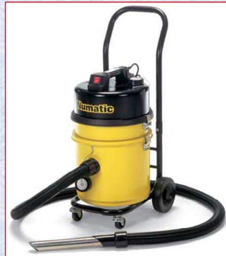
Specialised Hazardous Vacuums